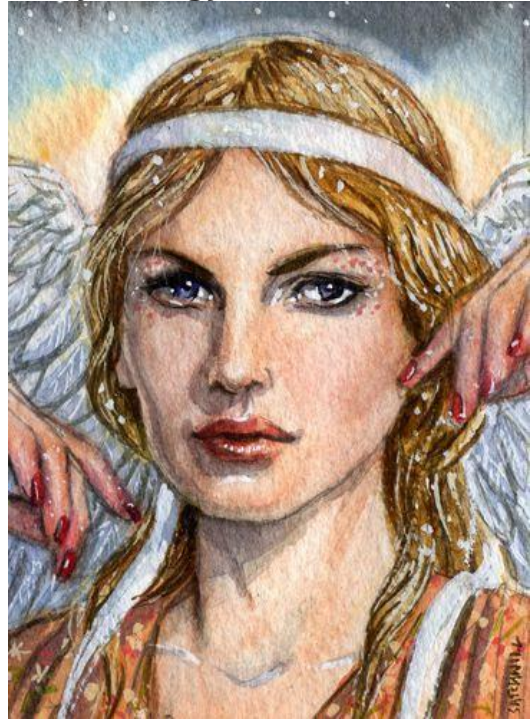
Ieous The Greek Goddess of Healing

Jesus has no connection to Yahoshua. None of the apostles ever taught in the name of Jesus or Iesous. They taught in the name that our Messiyah was given from on high, Yahoshua.