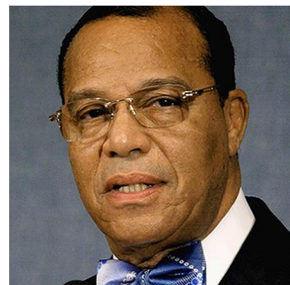
Louis Farrakhan Nation of Islam Leader

All religions worship a god or gods. The only thing that will separate your god from the next is his or her name. Over the years a very noticeable thing has been developing amongst African-American Christian Churches. The Nation of Islam leader, Louis Farrakhan (pictured right), has been traveling to the churches making speeches containing many references to God.